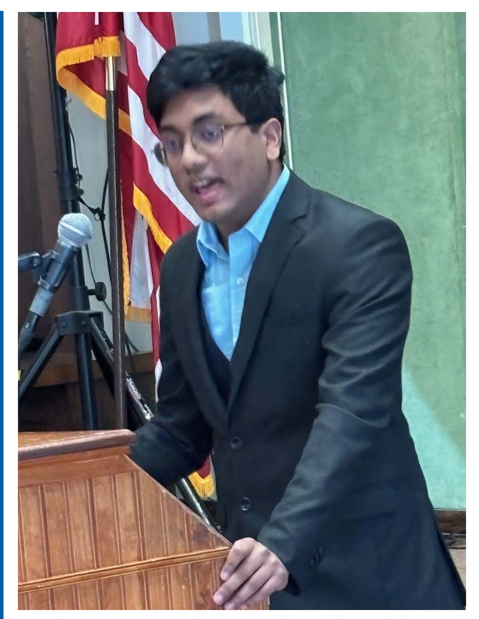
#1 The Topic: Student Apathy- What did you get from class?